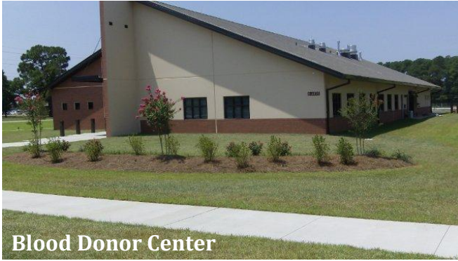
Blood Donor Center