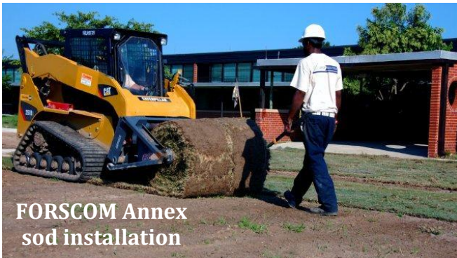
FORSCOM Annex sod installation

From the Landart Solutions website: We specialize in commercial and military landscape projects while also performing high quality residential projects. A majority of services are performed in-house, however, we are capable of selecting and managing specialty trades that allow us to provide turn-key landscape contracting.